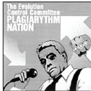
The Evolution Control Committee elevates the mash-up to high art.

Today's mash-up craze, where artists graft the a cappella version of one popular tune to the well-known instrumental backing of another, inspired a "band" like Columbus, Ohio's Evolution Control Committee to up the ante beyond anything that London's Freelance Hellraiser introduced to dance floors last year. Simply pasting Christina Aguilera's voice over the Strokes ("Genius in a Bottle") might be fun for fans of interchangeable pop culture, but in the end, it's about as artistically significant as that parody of Edward Hopper's late-night diner with Elvis, Marilyn and James Dean all sitting around, looking cool and eating